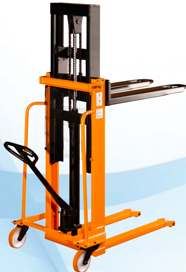
B10.20; B10.25; B10.30

Capacity: 1000kg Lifting height: 2000mm 2500mm 3000mm Lower lost height: 85mm Forks length: 1120mm Forks width: 540mm Aisle width: 2500mm Minimum turning radius: 1650mm